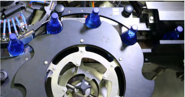
Starwheel for keeping gap between bottles